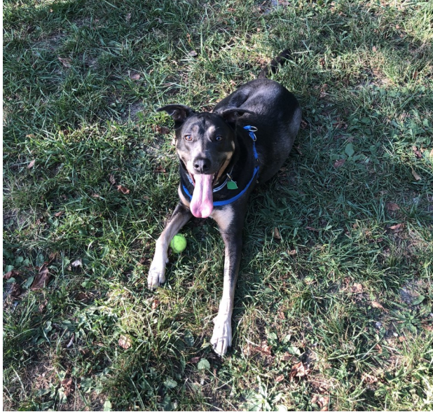
In loving memory of Wendell Whitlock

Be gentle with those smaller than you Always be ready for an adventure Take naps and get rest when you can Walks are good for the soul Be the bright spot in someone's day Guard things that are important to you Don't be afraid to get your feet wet, or dirty Be sweet with children Never ignore your favorite people Don't be afraid to leap Night-time snacks are okay Soak up every moment Rainy days are fun, too Don't be afraid to go to the doctor Love everyone Never stop being curious Play time is important Never give up